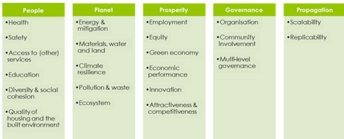
Figure 1. The CITYkeys indicator framework

The selection of indicators for the evaluation framework was based on the outcomes of a questionnaire regarding the needs of cities and citizens and internal discussions on the CITYkeys working definitions (Public available project report D1.1 4 ). Figure 1 shows the resulting structure of the evaluation framework.